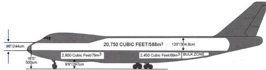
Cross section showing Main Deck and Lower Compartment